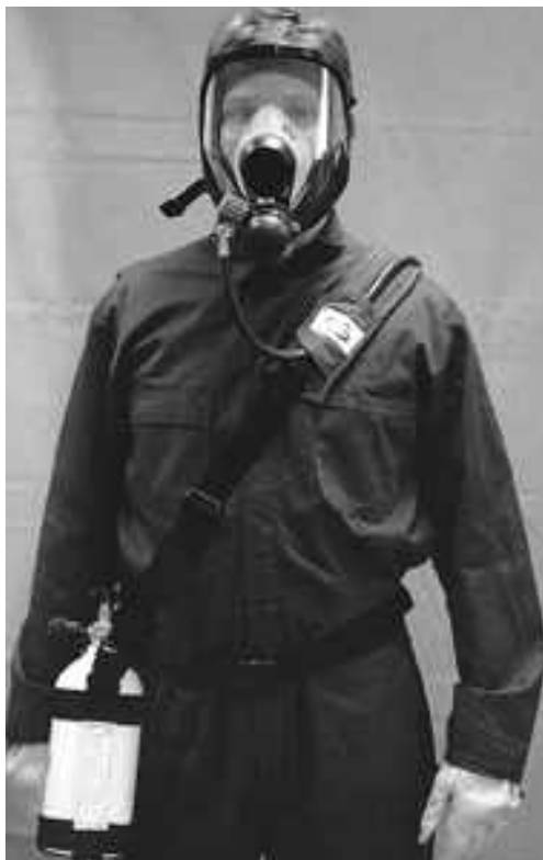
SPECPDE5L Airline Respirator with 5-minute Escape Air Cylinder